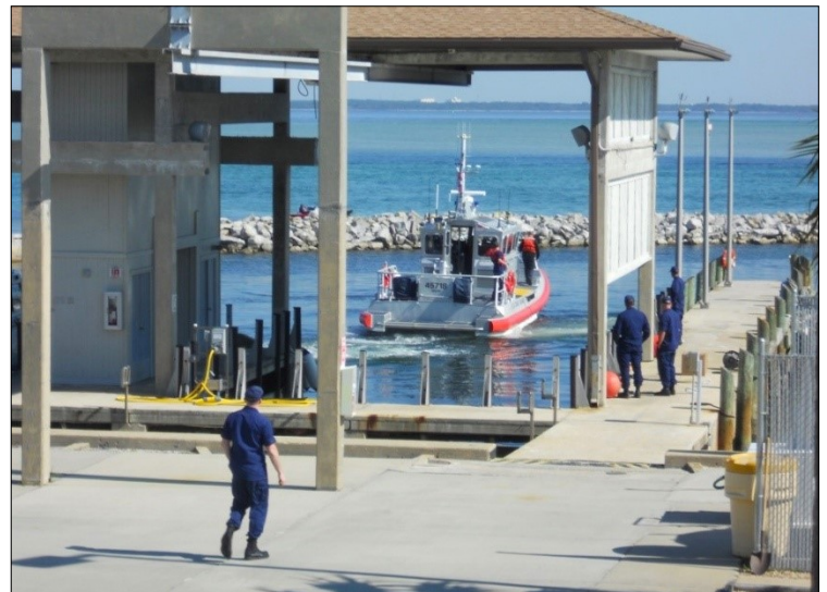
A Coast Guard station responds to a request for assistance. The crew scrambles to their boat and within minutes are on their way to assist a boater in distress.

The Coast Guard and we, as Auxiliarists, use the team concept in all activities whether it's training, conducting inspections or examinations, or actual response. Teamwork is the key to mission success. We, as Auxiliarists, have a unique opportunity to interface with the recreational boating public in many areas at many times. These opportunities include vessel safety exams, distribution of safety-related information through our partners, public education classes, marine safety and environmental protection activities, safety patrols and