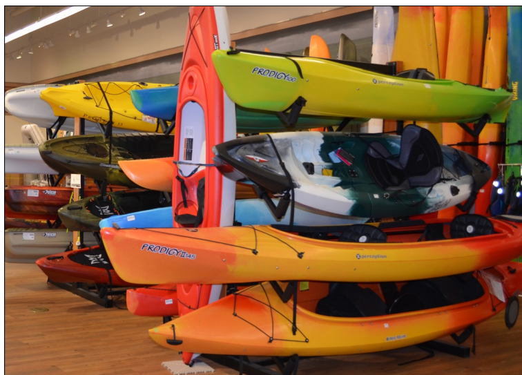
The staff at “big box” outlets may not be particularly knowledgeable about the details of the sport. The safety equipment offered for sale may be generic rather than specific to the location, and the sales personnel may or may not be knowledgeable about local needs.