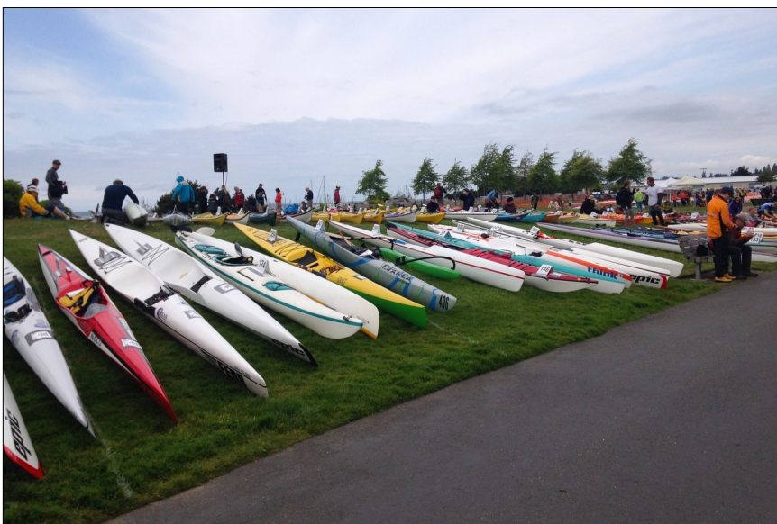
BELLINGHAM, Wash. — The annual Ski to Sea Race kayakers approach the second turn in the 5-mile paddle leg in Bellingham Bay. Bottom: Kayakers representing more than 300 teams made up of athletes ranging in experience from novice to Olympic competitor line the approach to the starting point ramp.